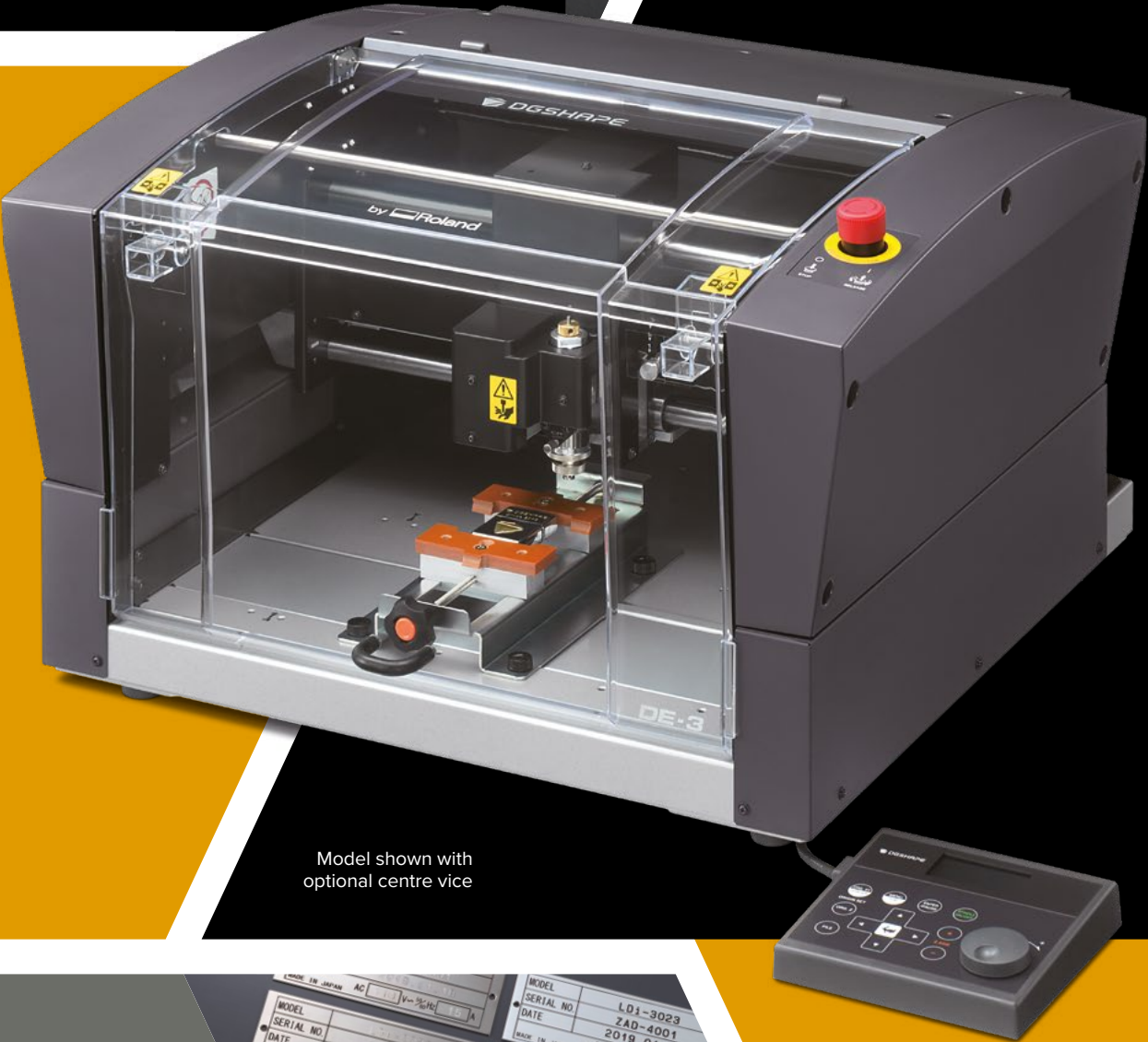
Model shown with optional centre vice

With remote machine management capabilities, the DE-3 offers USB and LAN connectivity for multiple machine engraving. Power up your production with the DE-3.